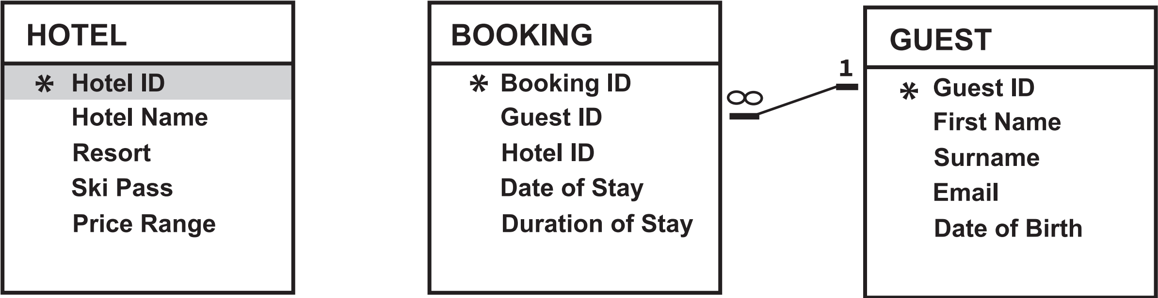
Image: Relationship for the HOLIDAY database.